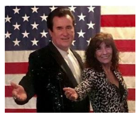
Friday Evenings ~ 6:30-9PM $5 Cover Charge, Free for Members & Veterans