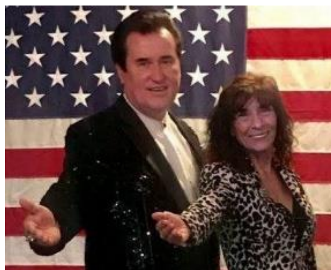
Friday Evenings ~ 6:30-9PM $5 Cover Charge, Free for Members & Veterans