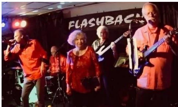
FLASHBACK BAND ~ Nov 14 th & 28 th , 7-10PM