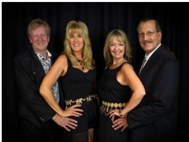
Sequel Band ~ Nov. 7 th & 21 st , 7-10PM

7-10:00PM ~ Doors Open @ 5PM COVER CHARGE SATURDAY EVENING