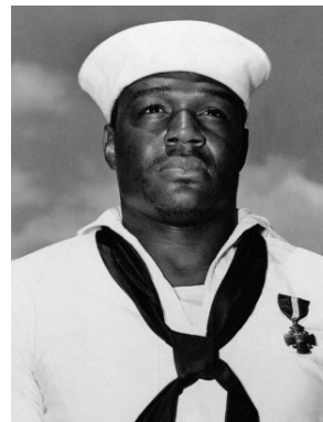
Pearl Harbor Hero Doris Miller

The U.S. Navy is naming an aircraft carrier after Doris "Dorie" Miller, the African American mess attendant who heroically leapt into combat during the bombing of Pearl Harbor. It marks the first time that an aircraft carrier has been named for an African American, and the first time a sailor has been so honored for actions taken as an enlisted man.