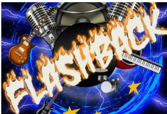
Flashback! Saturday Aug 14, 21 & 27 th .